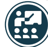
School & Home