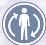
Animals Including Humans