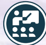
School & Home