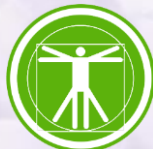
Leonardo Da Vinci