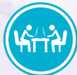
How Do Computers Impact On Our Lives