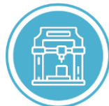
Computer Aided Design