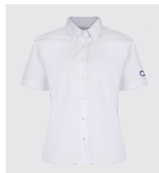
Twin Pack Shirt or Blouses