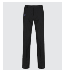
Trousers or Skirt